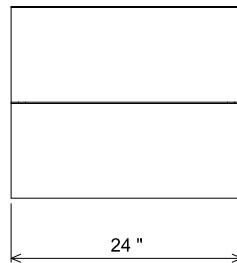
AT SINK CENTER SECTION